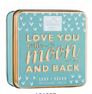
AO1057 LOVE YOU TO THE MOON AND BACK