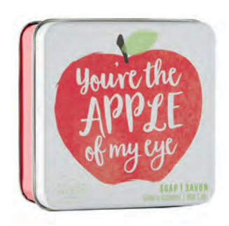
YOU'RE THE APPLE OF MY EYE