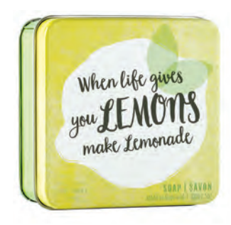
WHEN LIFE GIVES YOU LEMONS

(V) A01280: Assorted display of 16 (100g triple-milled soap in a tin)