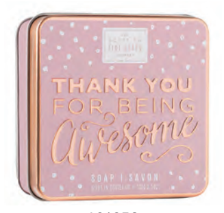
AO1056 THANK YOU FOR BEING AWESOME

A01055: Assorted display of 16 (100g triple-milled soap in a tin)