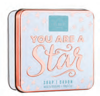
YOU ARE A STAR