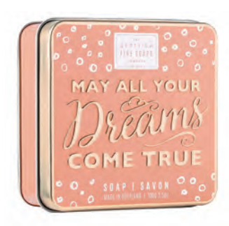
MAY ALL YOUR DREAMS COME TRUE