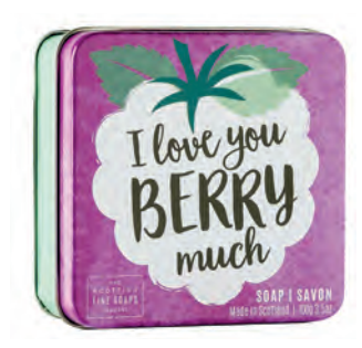
A01283 I LOVE YOU BERRY MUCH