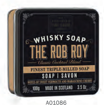
THE ROB ROY

AO1085: Assorted display of 16 (100g triple-milled soap in a tin)