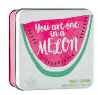
AO1284 YOU ARE ONE IN A MELON